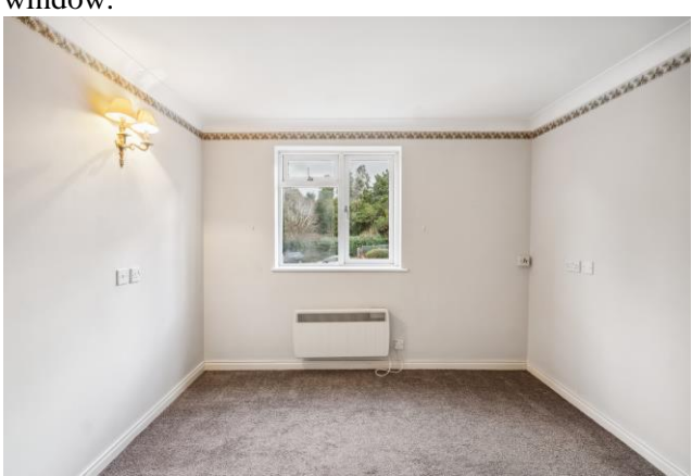
BEDROOM with double glazed window, built in wardrobe, electric radiator.

KITCHEN with a range of matching floor and wall units, wood effect work surfaces, electric cooker point, extractor fan, single drainer single bowl sink unit, space for fridge, electric heater, double glazed window.