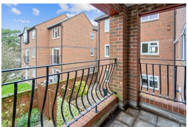
SITTING ROOM with double glazed doors to BALCONY , feature fireplace with marble surround and inset electric fire, storage heater and door to