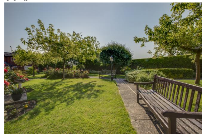
There is RESIDENTS PARKING and a well kept COMMUNAL GARDENS .

TENURE : this apartment is Leasehold and had an original 99 years from August 1987 and there has 62 years remaining.