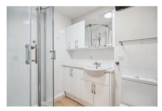
SHOWER ROOM with tile and glazed shower cubicle, vanity wash hand basin, low level w.c., wall heater, extractor fan, heated towel rail.